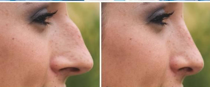
Powered microsaws are particularly beneficial for evenly reducing bumps of bone and cartilage on the nasal bridge.