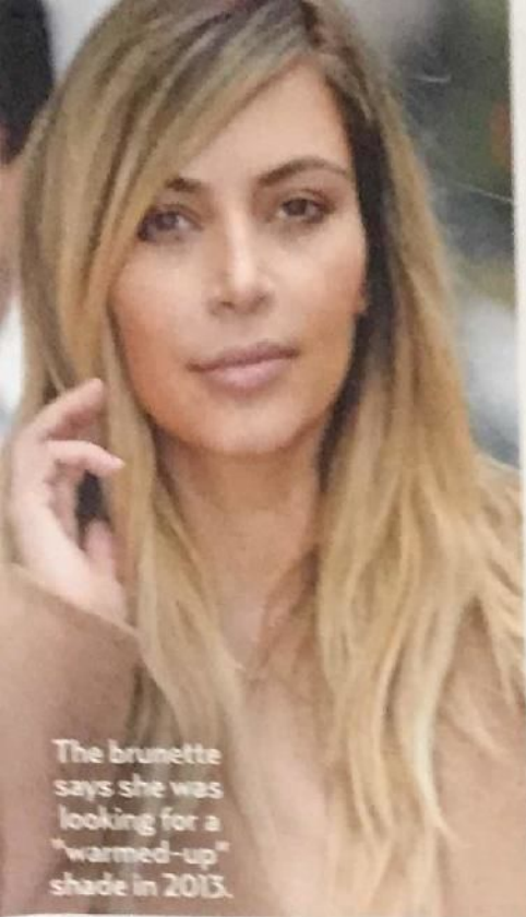
The brunette says she was looking for a "warmed-up" shade in 2013.

nose, cheeks and chin. One spot that's off-limits: her eyes. Before one 2012 event, says the source, "she got a little too much around her eyes and didn't like it. She avoids that area now." When it comes to treating the itchy red patches caused by her chronic psoriasis, however, there's little she won't try. The mom of 21-month-old North uses a $795 LED light-therapy machine to boost collagen and even once rubbed sister Kourtney's breast milk on her skin because, as she explained, "I read online it's a cure."