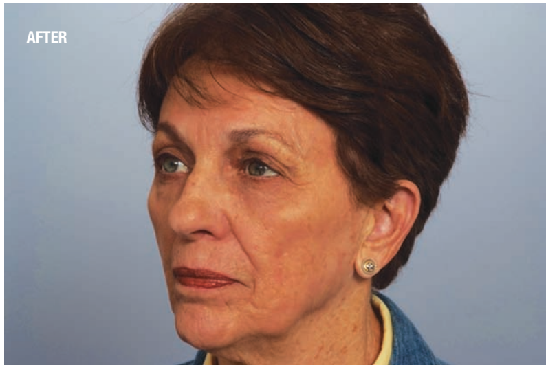
CO 2 and Erbium:YAG, 2 months post treatment.

ated CO 2 at 22 watts, pulse duration of 2 ms and density of 35%, followed by a single Erbium:YAG pass at 600 mJ, achieves excellent and consistent results. This treatment algorithm takes less than 10 minutes,” he says.