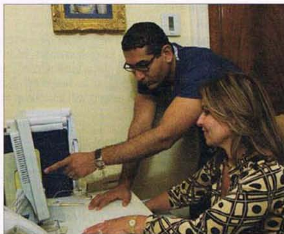
Rizk's Park Avenue office and surgical suite are state-of-the-art in all respects.

In appearance, Rizk's Park Avenue office and surgical suite are state-of-the-art with soothing music playing and flat-screen televisions in the waiting room showing relaxation videos; germ-free bathrooms, subzero refrigerators and built-ins; fiber optic wiring; and all supplies and shelving