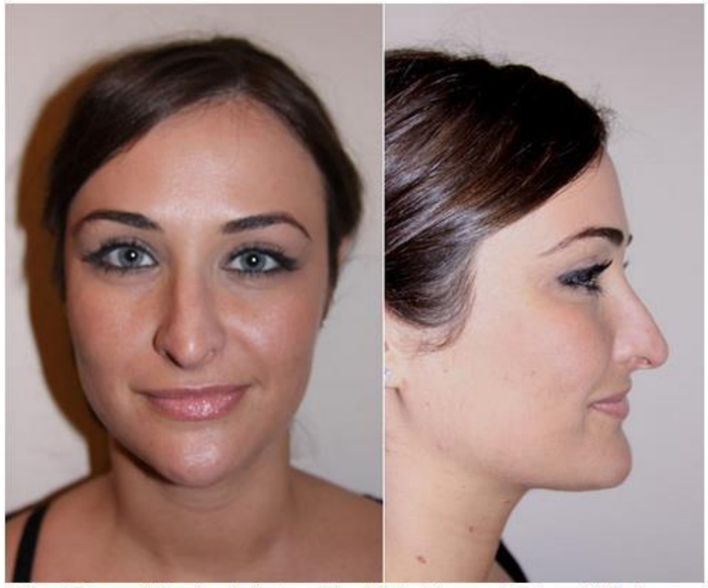
Before: A 26-year-old female patient had a revision rhinoplasty to correct a collapsed right side as well as droopy tip.