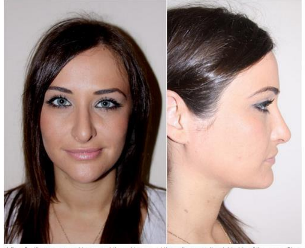
After: Cartilage was used to support tip and to correct the collapse on the right side of the nose. She is shown two months after revision rhinoplasty and will take one year to completely heal.