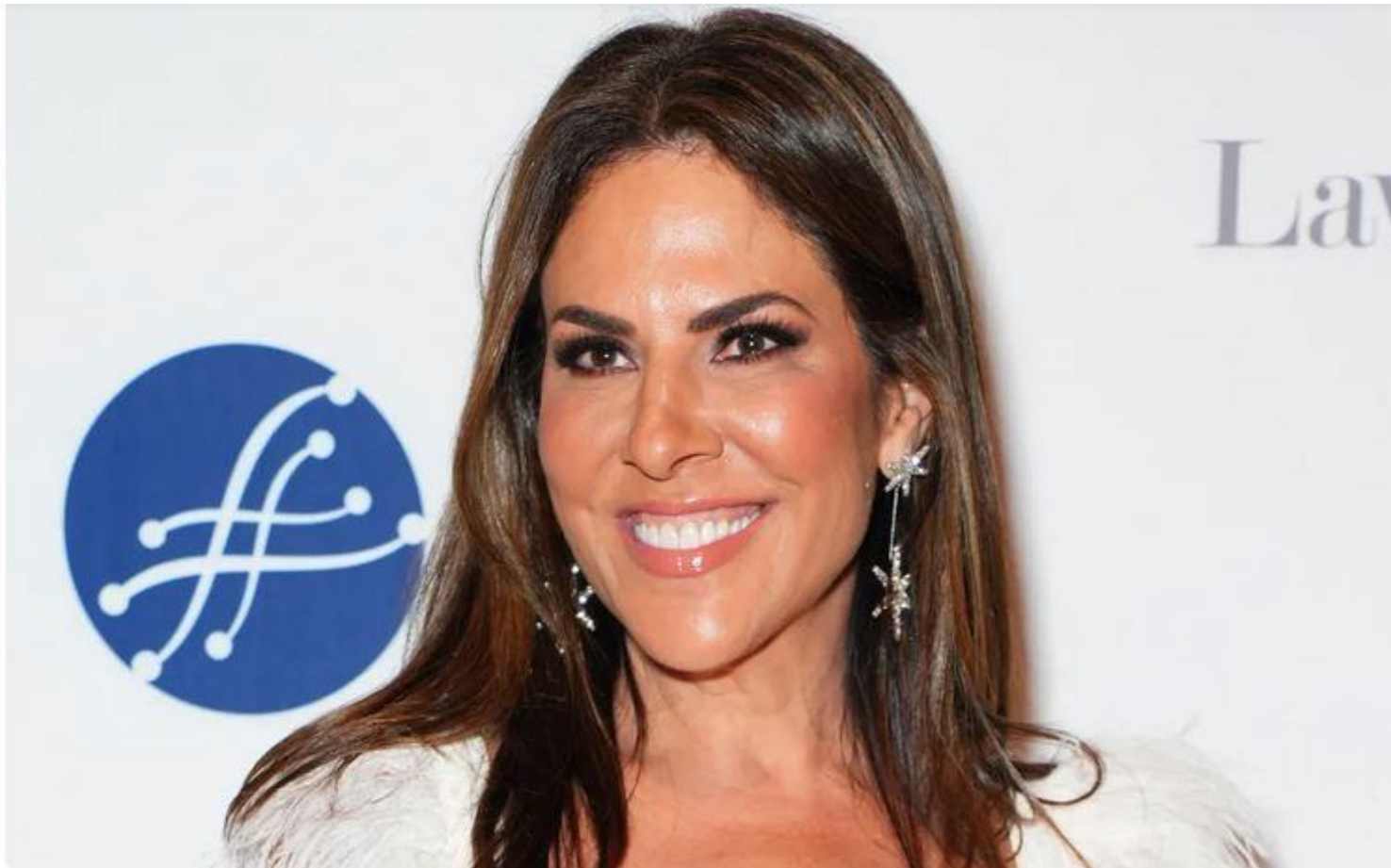
Jennifer Fessler Got a Facelift, Neck Lift & Nose Job and She's "Obsessed" (PICS)

We're only just getting to know Jennifer Fessler on The Real Housewives of New Jersey , but the Bravo newbie is already sharing major details about her life.