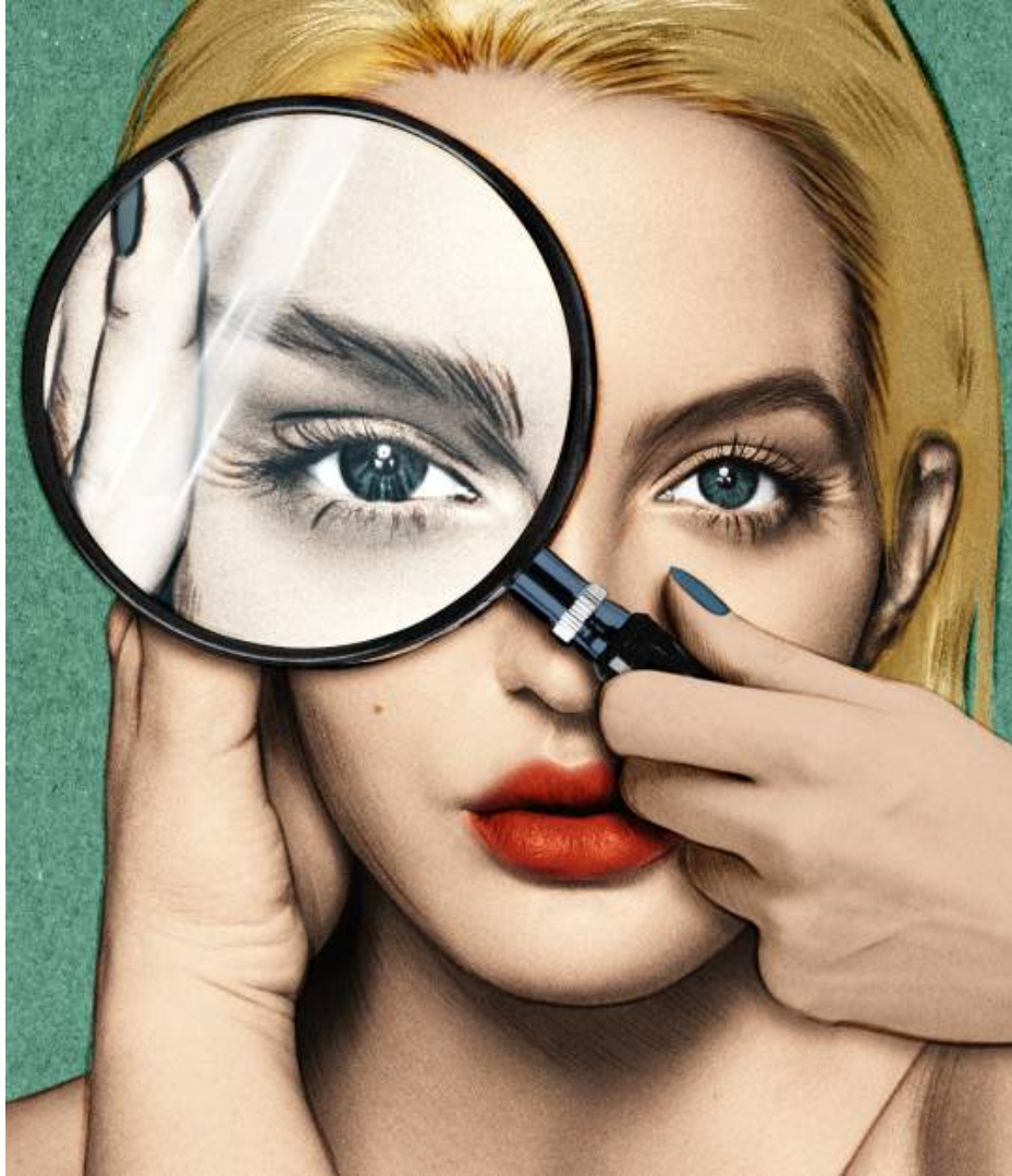
Illustration: Mari Fouz

They say that 60 is the new 40. But when it comes to facelifts, you might want to reverse those numbers.